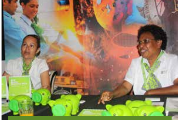
PROMOTING BUSINESS & INVESTMENT