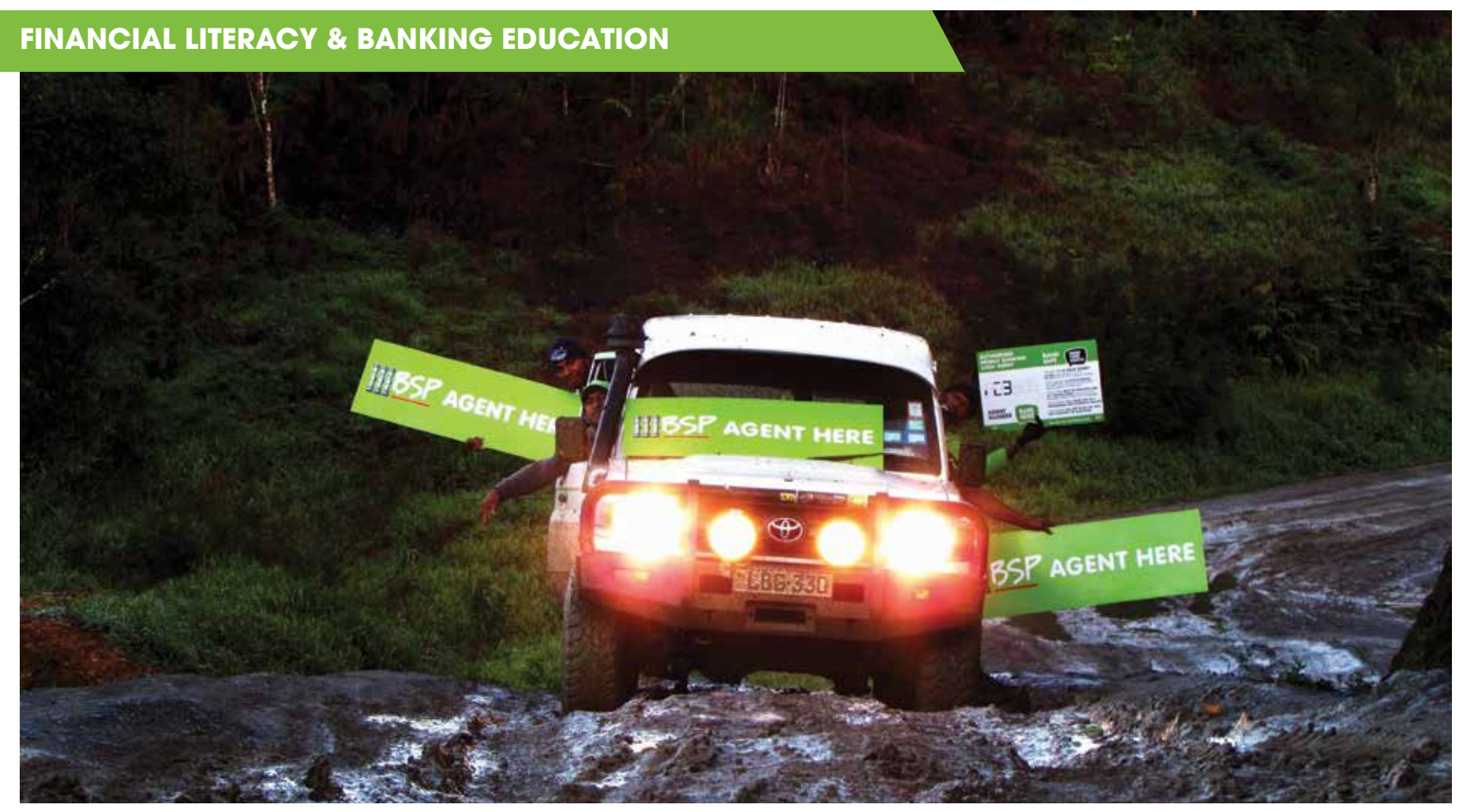
We don't just teach people how to save, we set up Agents in their communities, so they don't have to travel far to deposit money. Menyama, Morobe Province.