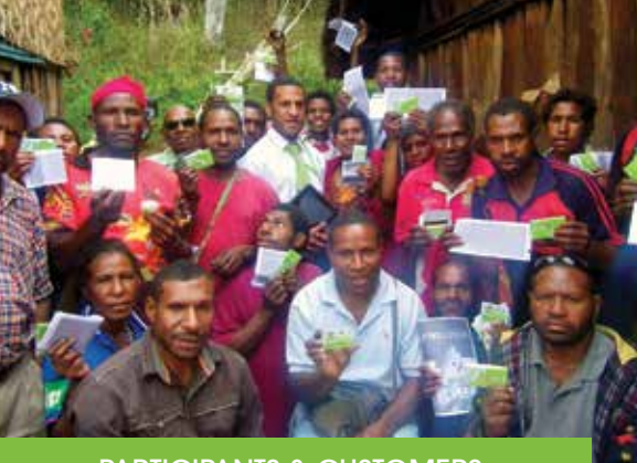
PARTICIPANTS & CUSTOMERS