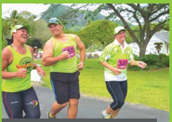
ROAD RACE, TONGA

Quick fact: BSP acquired Westpac Operations in SI, Cook Islands, Samoa and Tonga in July 2015.