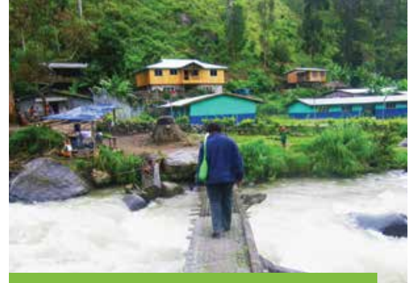
CHECKING AGENTS IN REMOTE PNG

BSP has 291 Agents in communities PNG wide, providing basic banking closer to home.