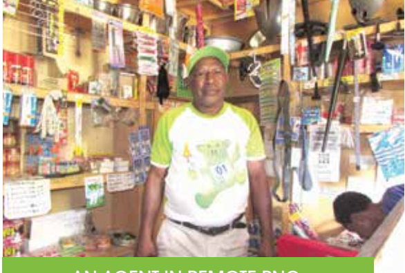
AN AGENT IN REMOTE PNG