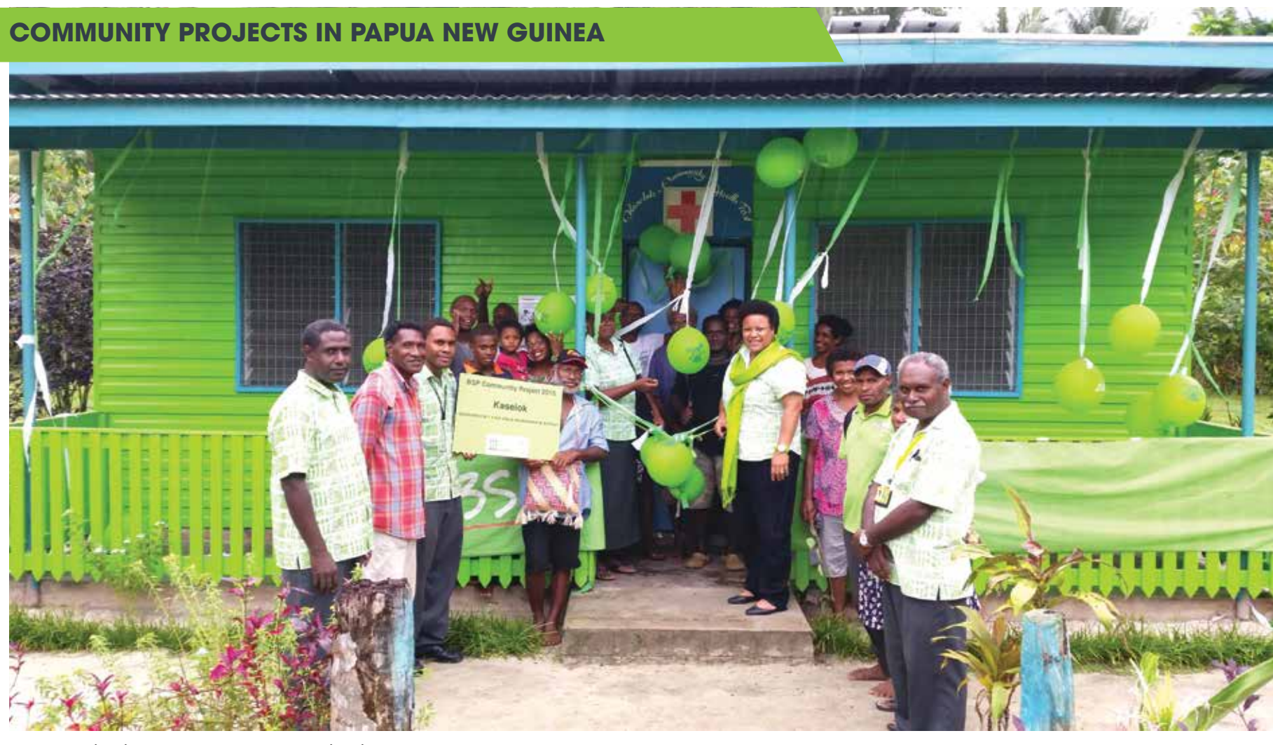
Renovated aidpost in Kavieng, New Ireland Province.