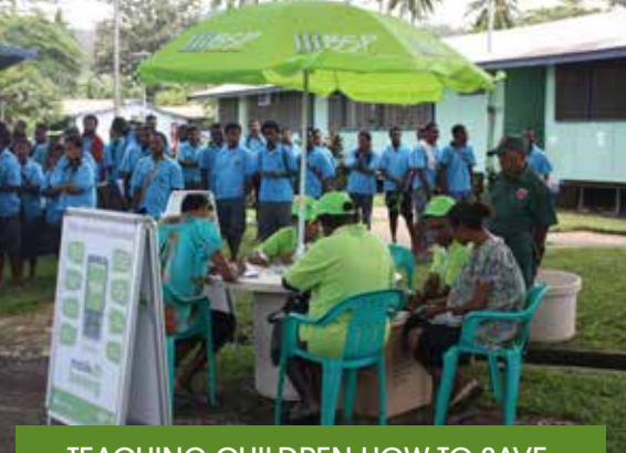
TEACHING CHILDREN HOW TO SAVE