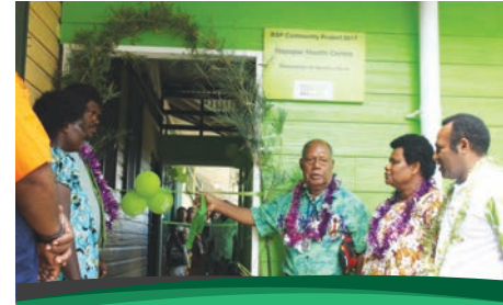
BSP Kokopo renovated the ablution block for Napapar Health Clinic