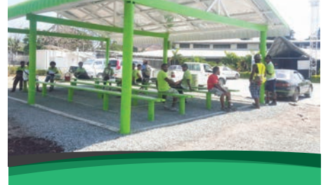
BSP Group Risk Management built a waiting area for patients at Gerehu Hospital