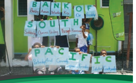
BSP Capital Ltd renovated a ablution block for Save our Children and Youth