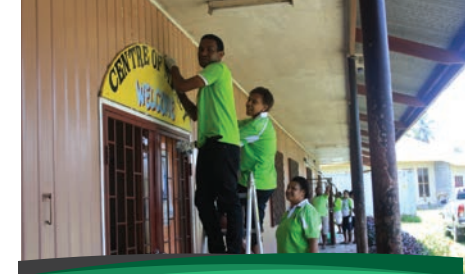
BSP Lae Market Branch cleaned up Family Support