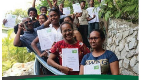
Financial Literacy Training for fashion designers