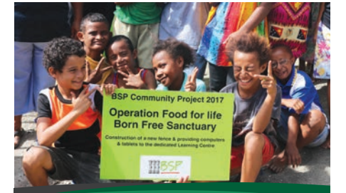
BSP Treasury built a new fence and donated computers to Operation Food for Life program