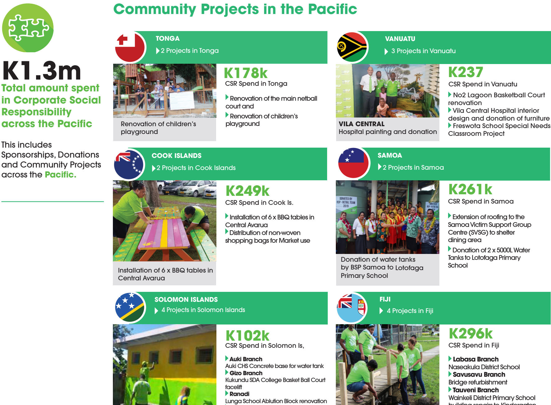
RANADI Lunga School Ablution Block renovation