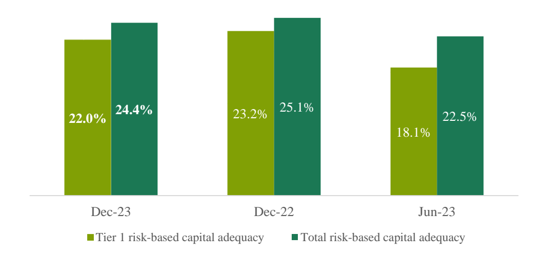
As of 31 December 2023, the Group's overall capital adequacy and leverage capital ratios met the capital adequacy criteria for a "well-capitalised" bank.