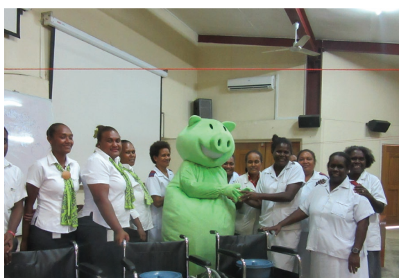
NATIONAL REFERRAL HOSPITAL - Solomon Islands