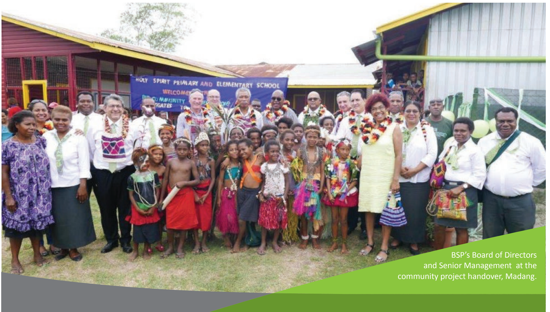
BSP's Board of Directors and Senior Management at the community project handover, Madang.

Our staff continue to deliver projects that are aimed to enrich communities and build unity. This is supported by the Board and Management. In Madang, Board Members took the opportunity to visit the Madang Holy Spirit Primary School to hand over new tanks that were installed by BSP Madang staff.