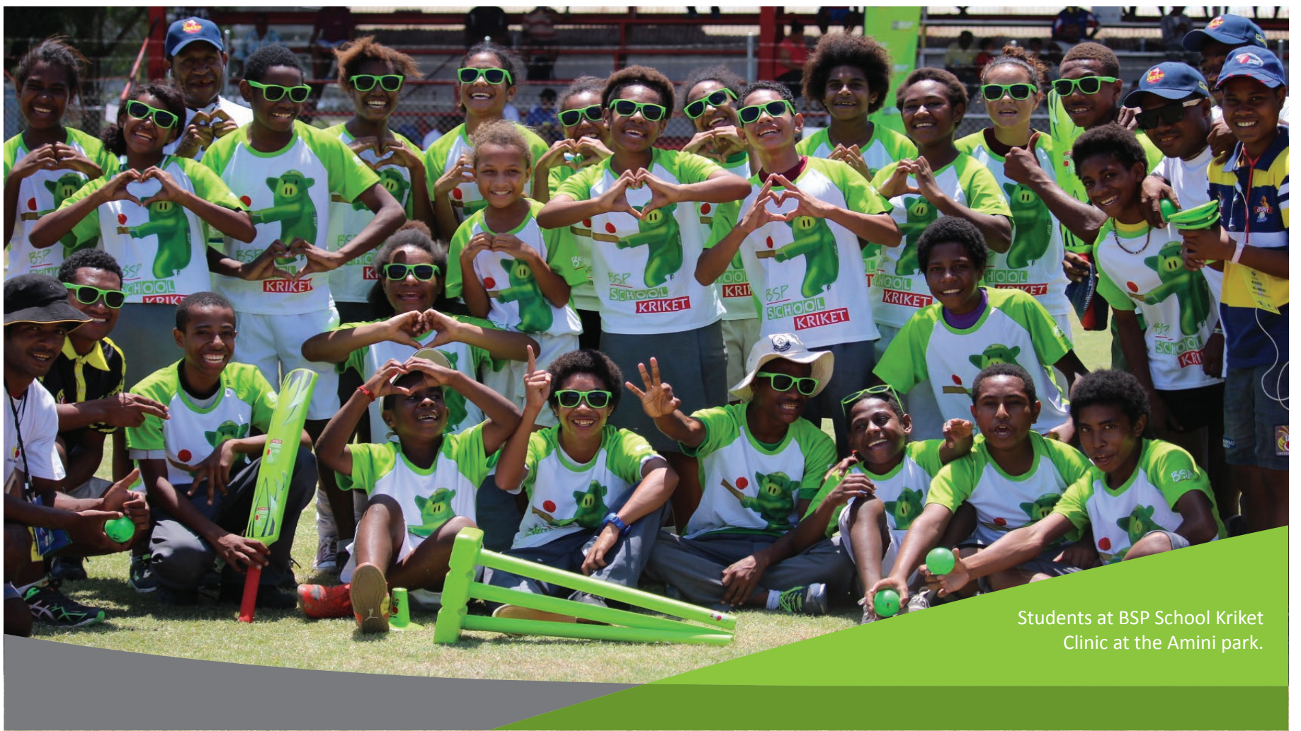
Students at BSP School Kriket Clinic at the Amini park.