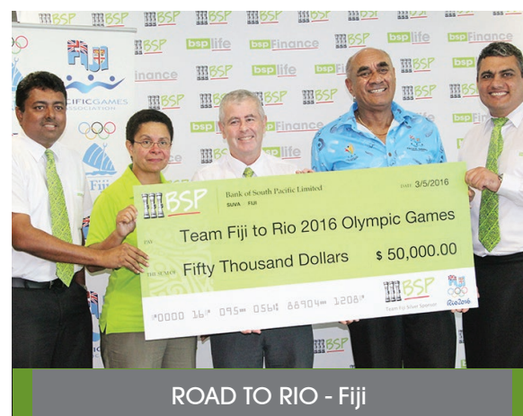
ROAD TO RIO - Fiji