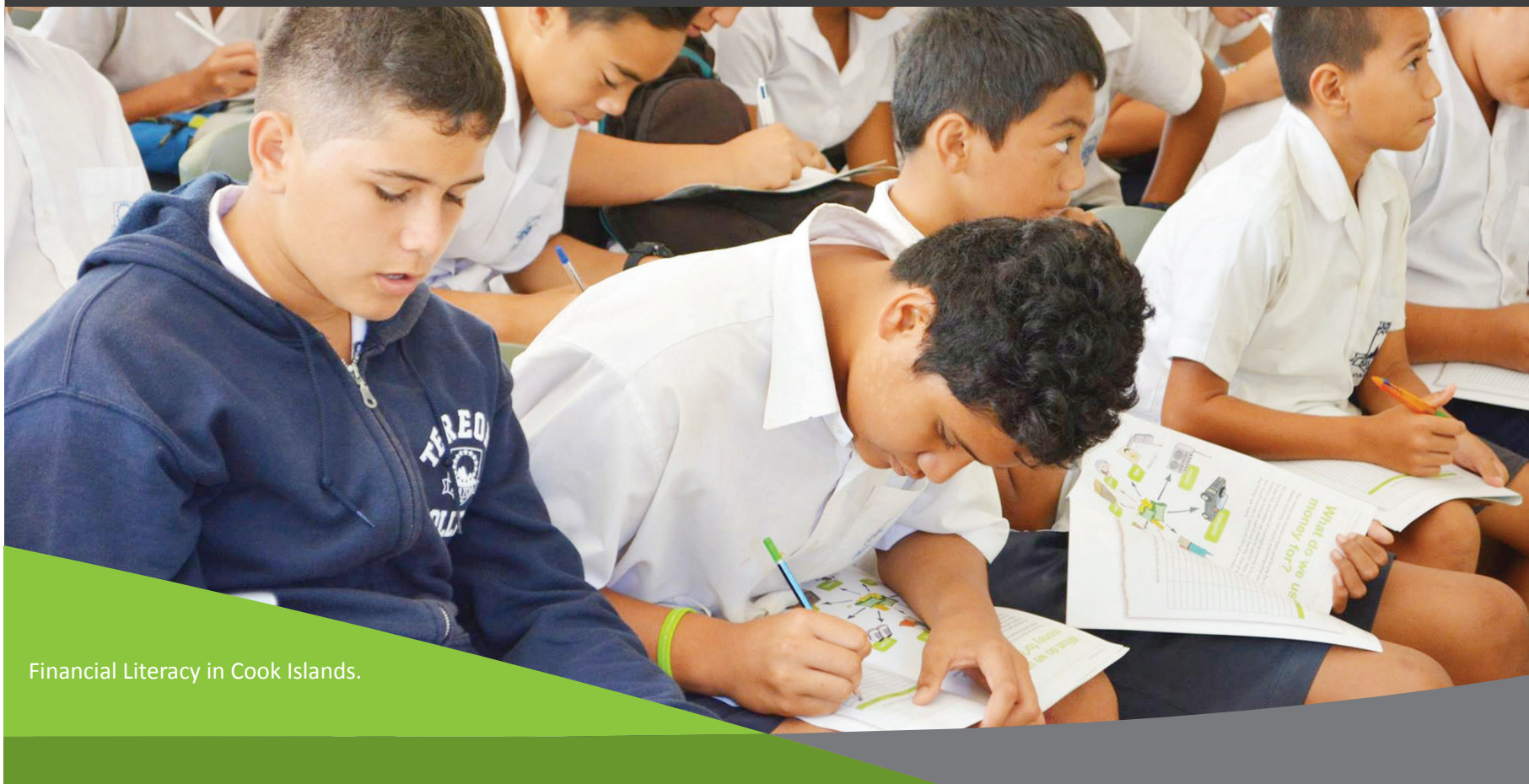
Financial Literacy in Cook Islands.

Financial education is key to self-sufficiency and peace of mind. At BSP, Banking Education and Financial Literacy is offered through each of our branches. We do this, because we believe that continual education of our customers and the community will contribute to the development of individuals.