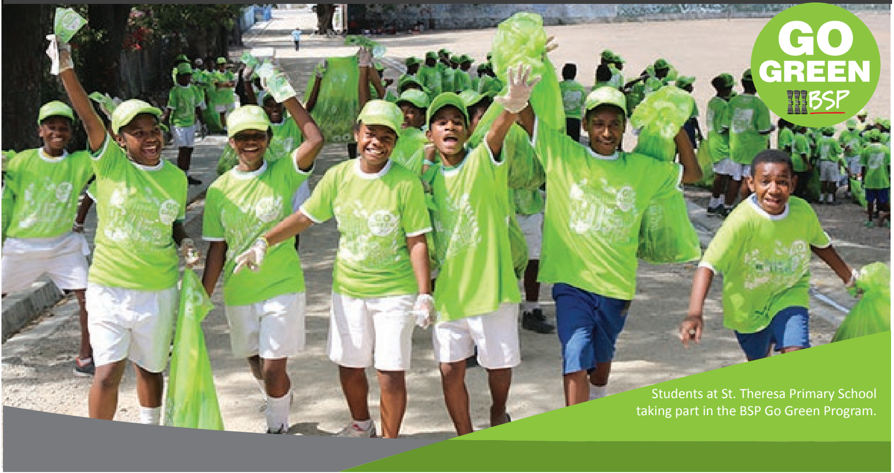
Students at St. Theresa Primary School taking part in the BSP Go Green Program.

At BSP, we care about promoting sustainable business practices while supporting economic growth in the countries we operate in. This is one of the reasons why we live to be the Greenest Bank in the Pacific. We embrace a balanced approach to business and to ensure that we educate our young generation to be mindful of litter and cleaning up our local environment.