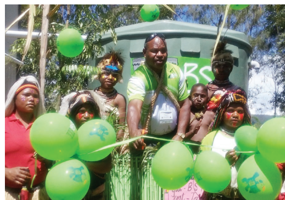
WATER TANK LAUNCH - Tari