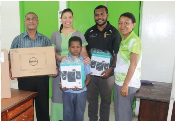
PNG BLIND SERVICE CENTRE - Port Moresby