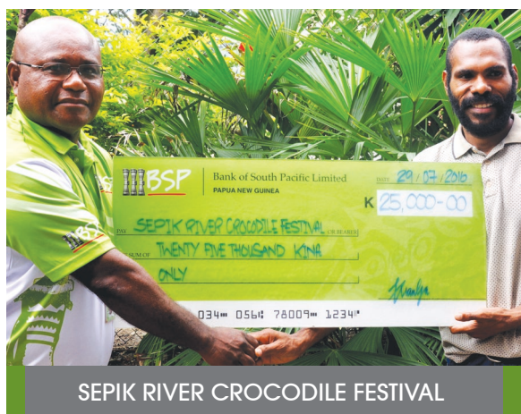
SEPIK RIVER CROCODILE FESTIVAL