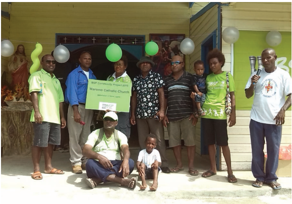
VANIMON - Waromo Catholic Church