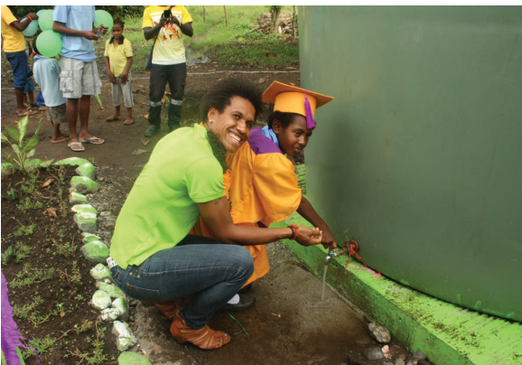
LAE MARKET - Gelam Musom Christian School