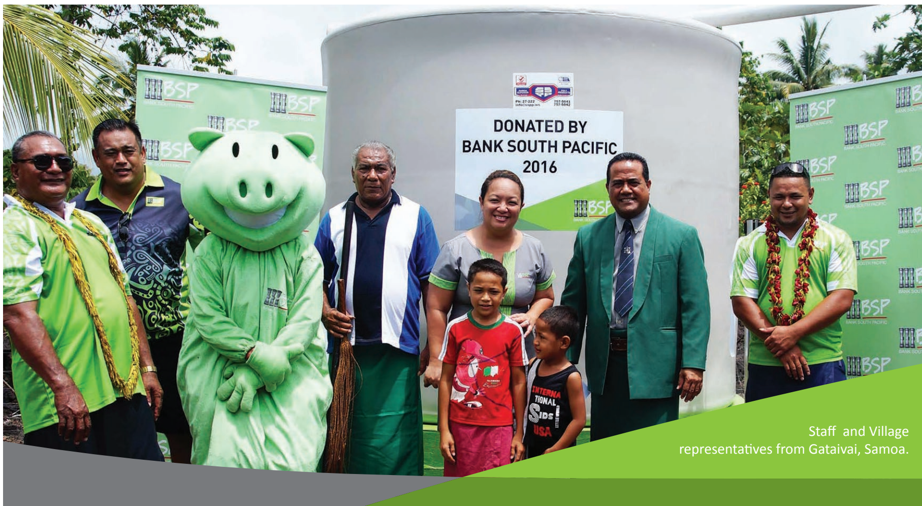
Staff and Village representatives from Gataivai, Samoa.