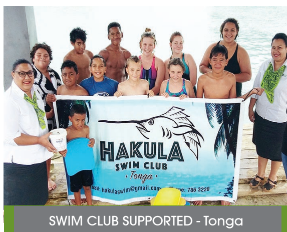
SWIM CLUB SUPPORTED - Tonga