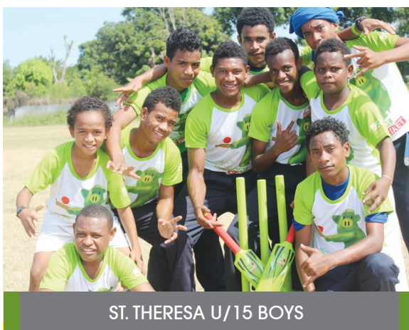
ST. THERESA U/15 BOYS