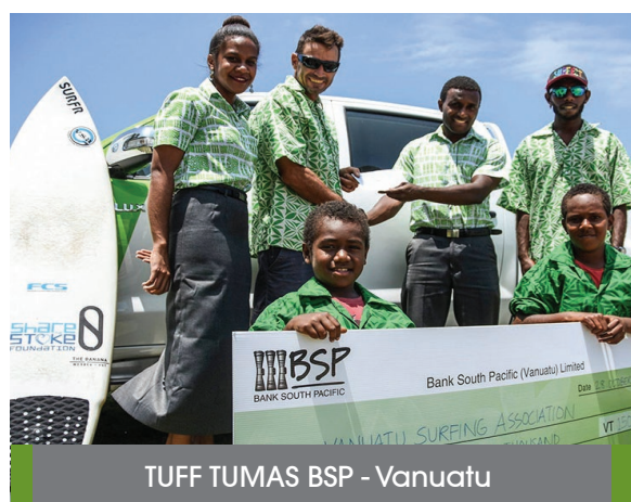
TUFF TUMAS BSP - Vanuatu

Quick fact: BSP acquired Westpac Operations in Vanuatu in July 2016.