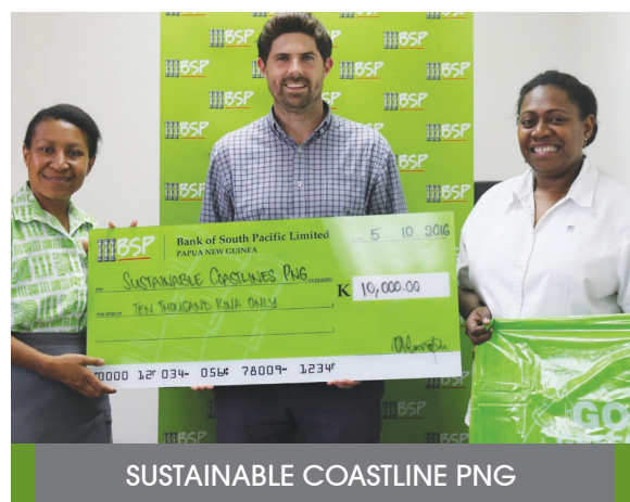
SUSTAINABLE COASTLINE PNG