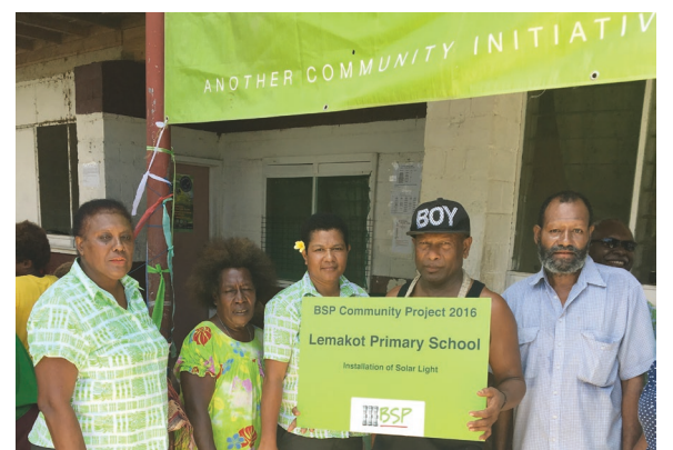
LEMAKOT - Kavieng