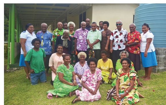
NAMARAI HEALTH CENTRE - Fiji