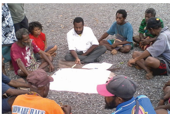
PARTICIPANTS IN DISCUSSION - PNG

BSP has 291 Agents in communities PNG wide, providing basic banking closer to home.