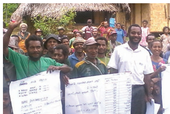
PARTICIPANTS PRESENTATION - PNG