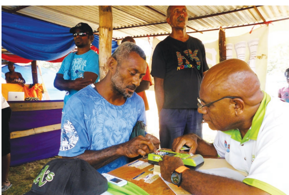
ACCOUNT OPENING - Fiji