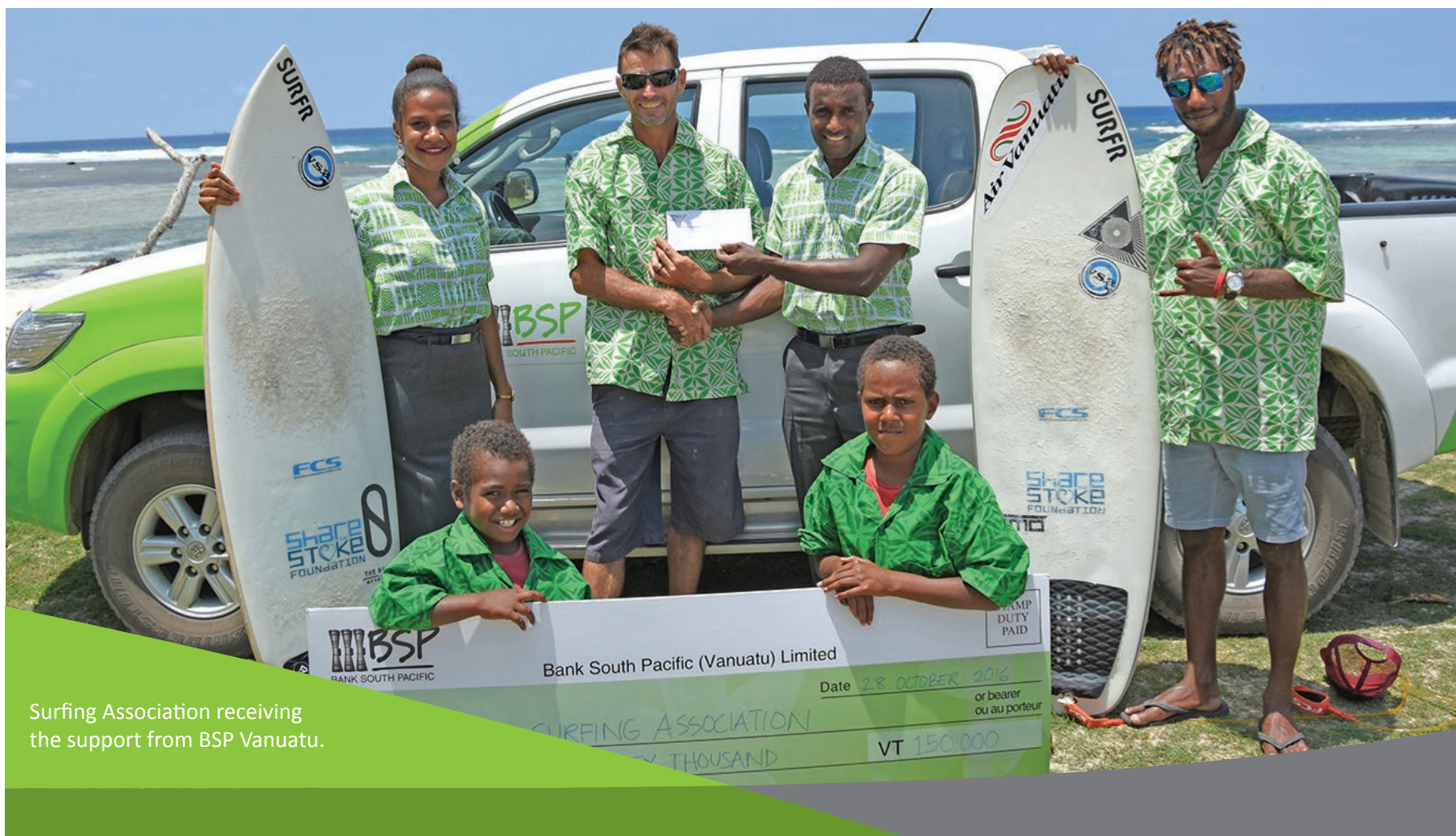
Surfing Association receiving the support from BSP Vanuatu.

As part of our ongoing commitment to strengthen community relationships, we support organisations by providing donations in cash and kind to support worthy causes.