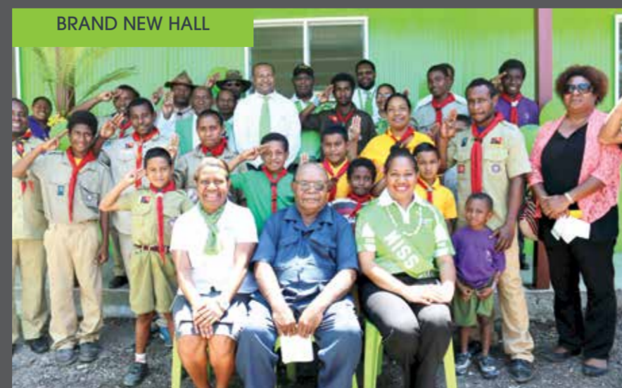
BRAND NEW HALL

Each year we deliver many worthy projects that make a meaningful difference to recipient communities