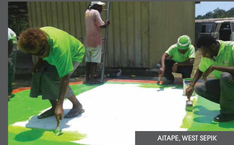
AITAPE, WEST SEPIK