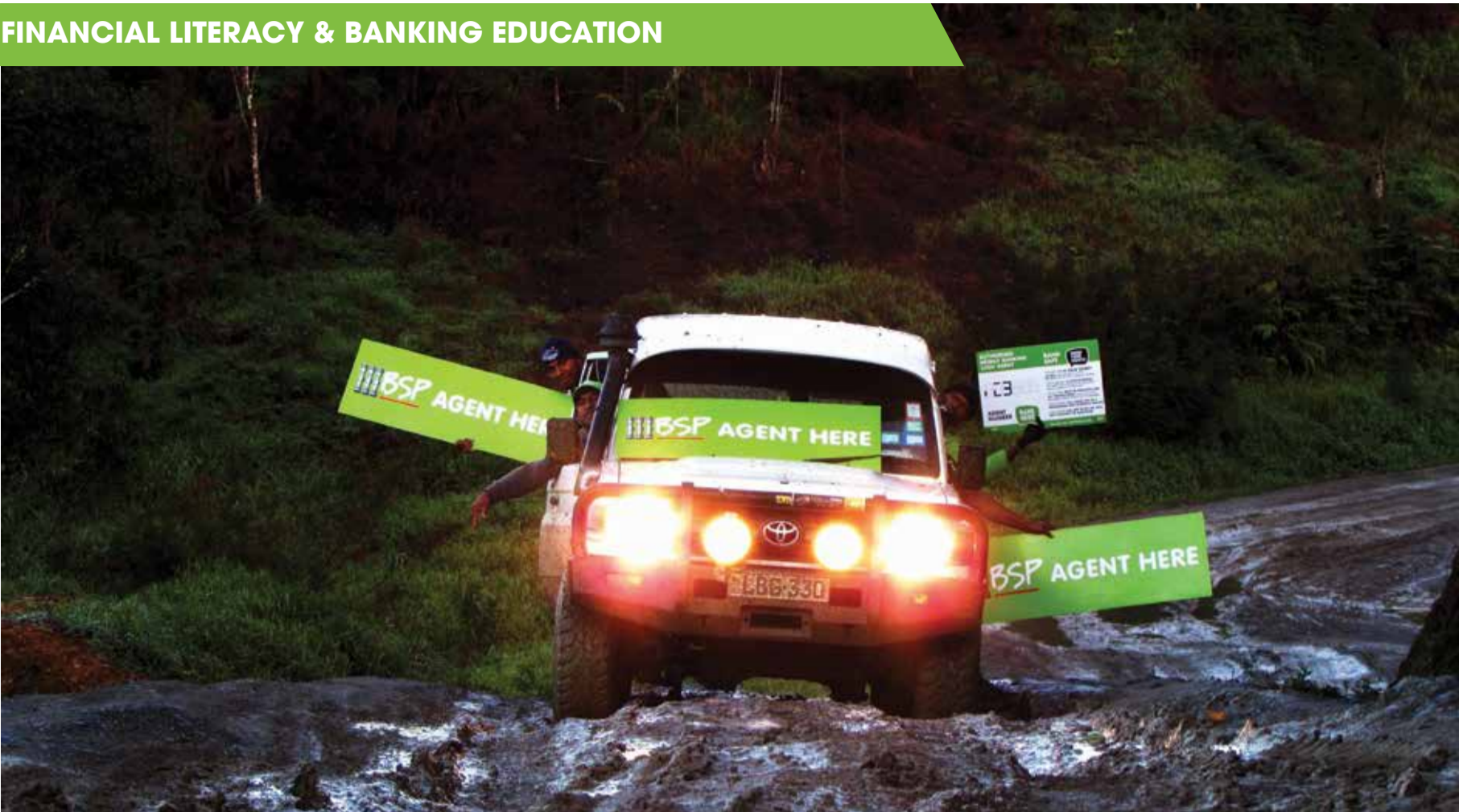
We don't just teach people how to save, we set up Agents in their communities, so they don't have to travel far to deposit money. Menyama, Morobe Province.

Whether it's teaching people how to manage money, using the right product and service or opening new accounts for children, students and adults...we go to where our customers are - even if it means enduring rugged terrain. Here are some highlights: