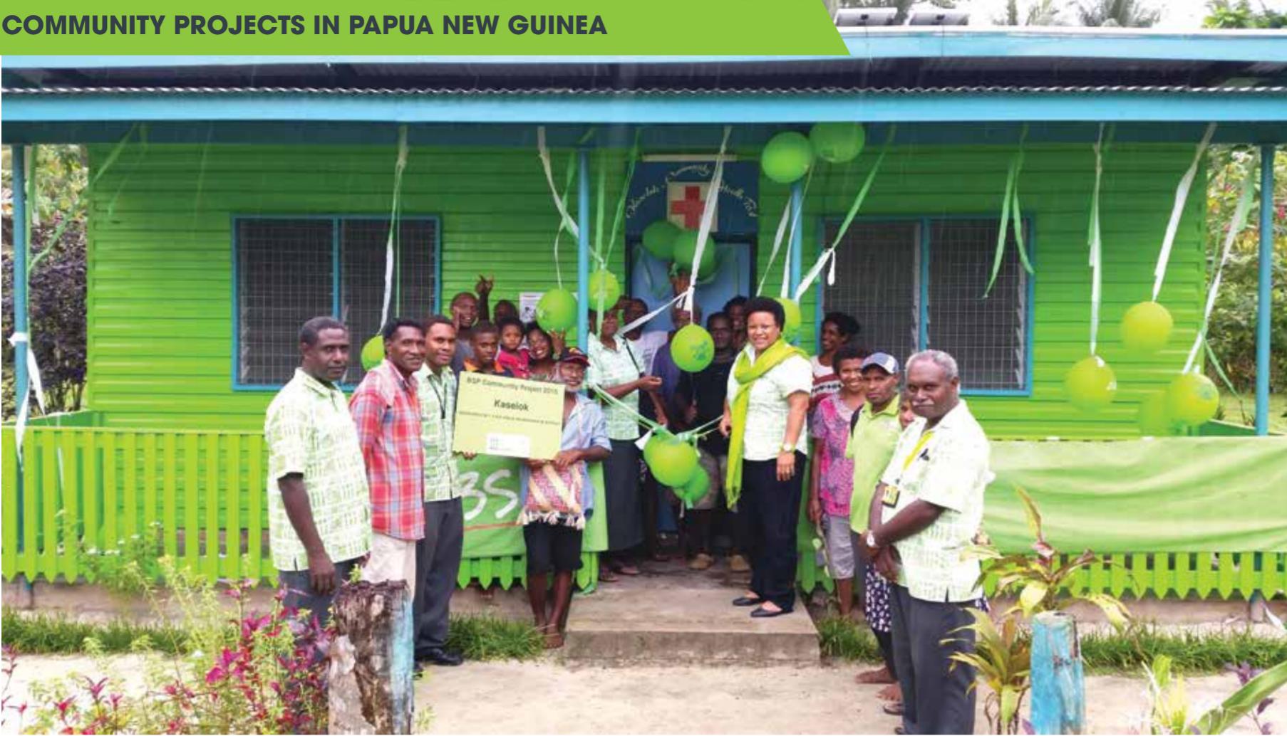
Renovated aidpost in Kavieng, New Ireland Province.