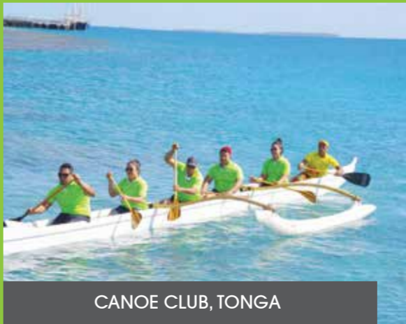
CANOE CLUB, TONGA