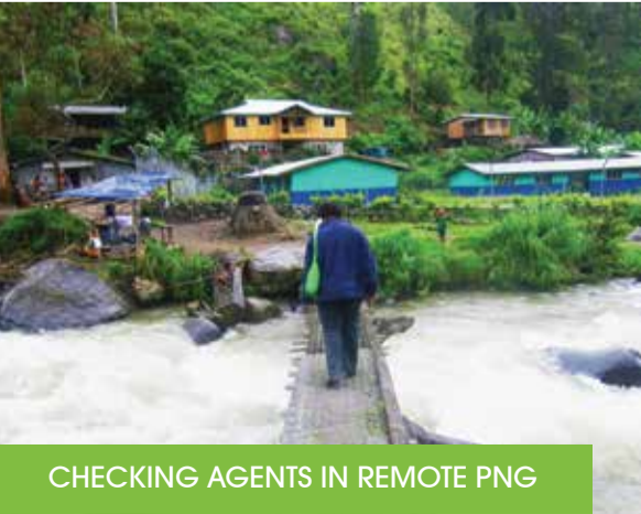
CHECKING AGENTS IN REMOTE PNG

BSP has 291 Agents in communities PNG wide, providing basic banking closer to home.