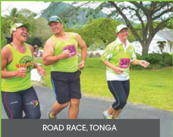
ROAD RACE, TONGA