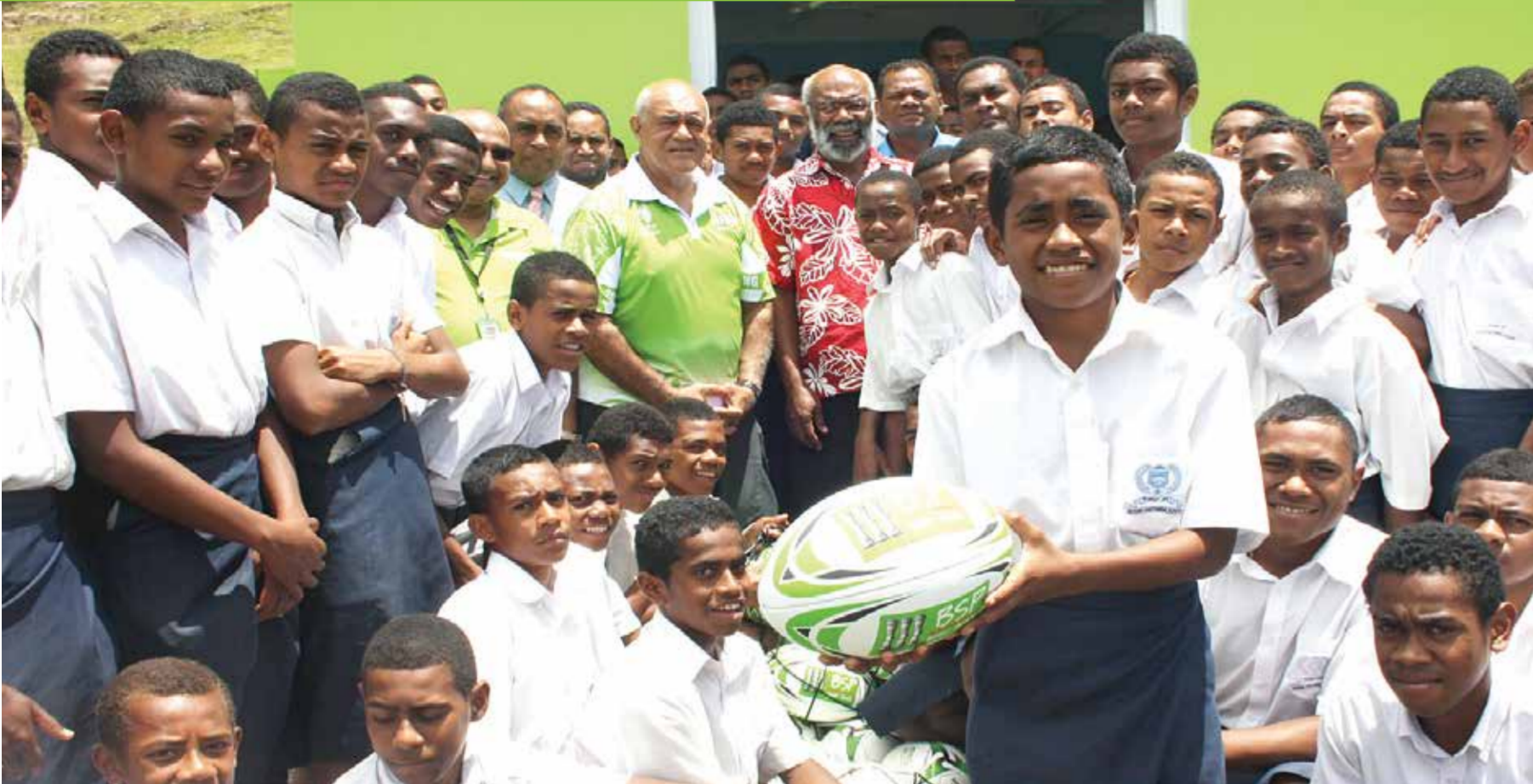
Queen Victoria School Gym.