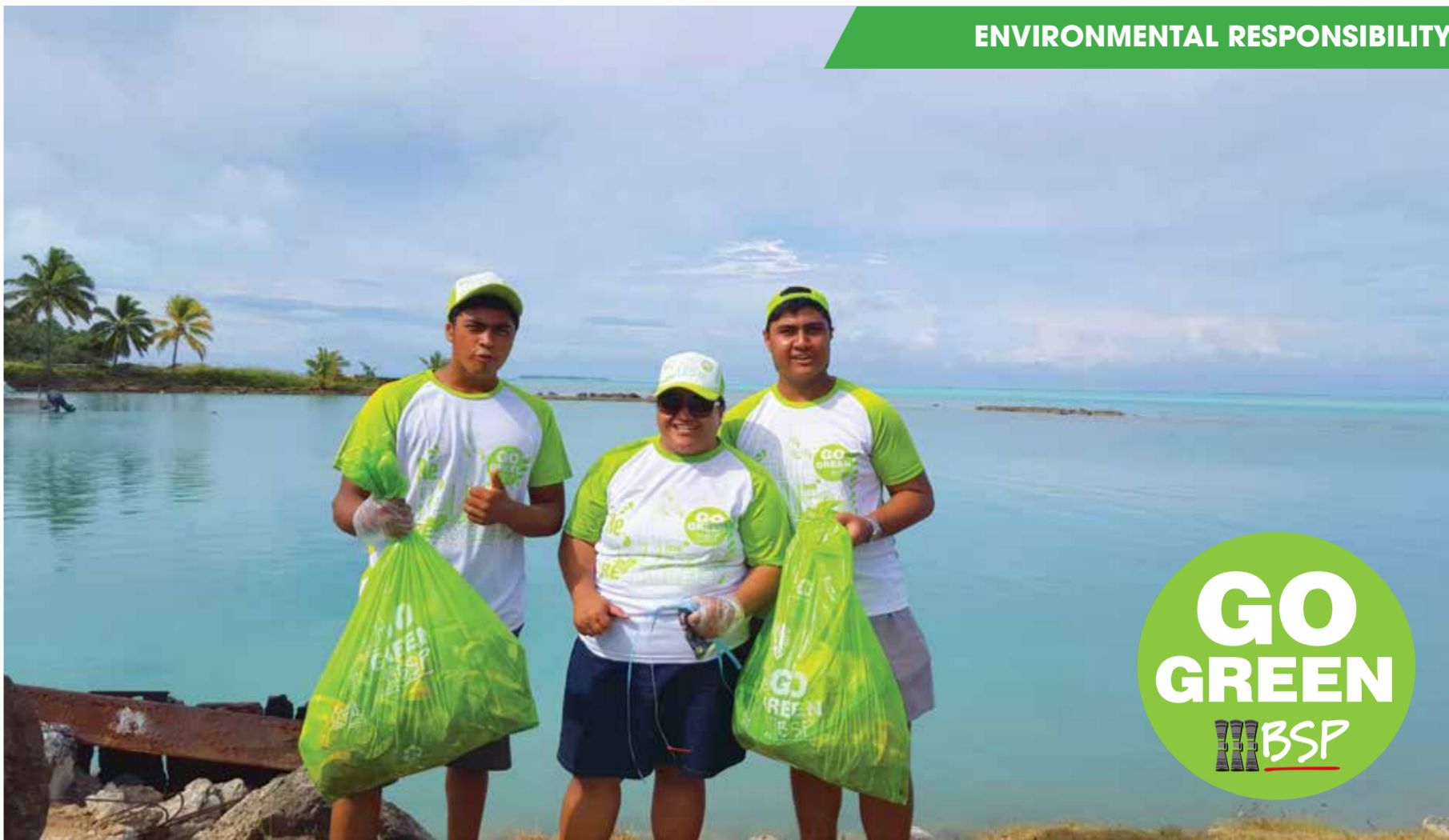
Cook Islanders participating in the Annual School Clean Up Day.