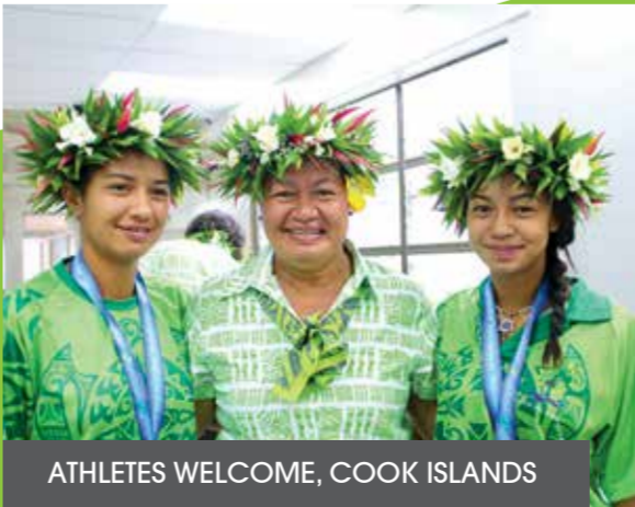
ATHLETES WELCOME, COOK ISLANDS

Quick fact: BSP acquired Westpac Operations in SI, Cook Islands, Samoa and Tonga in July 2015.