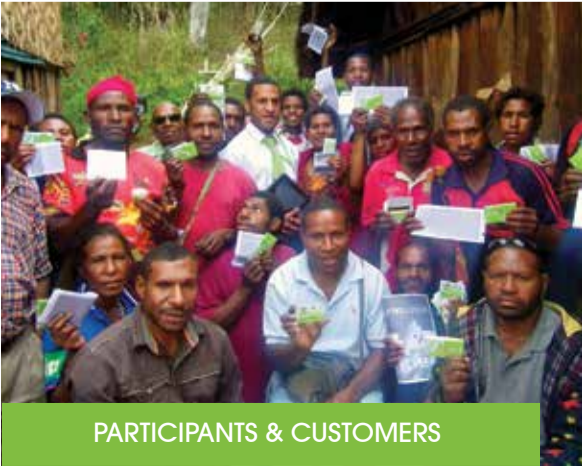
PARTICIPANTS & CUSTOMERS