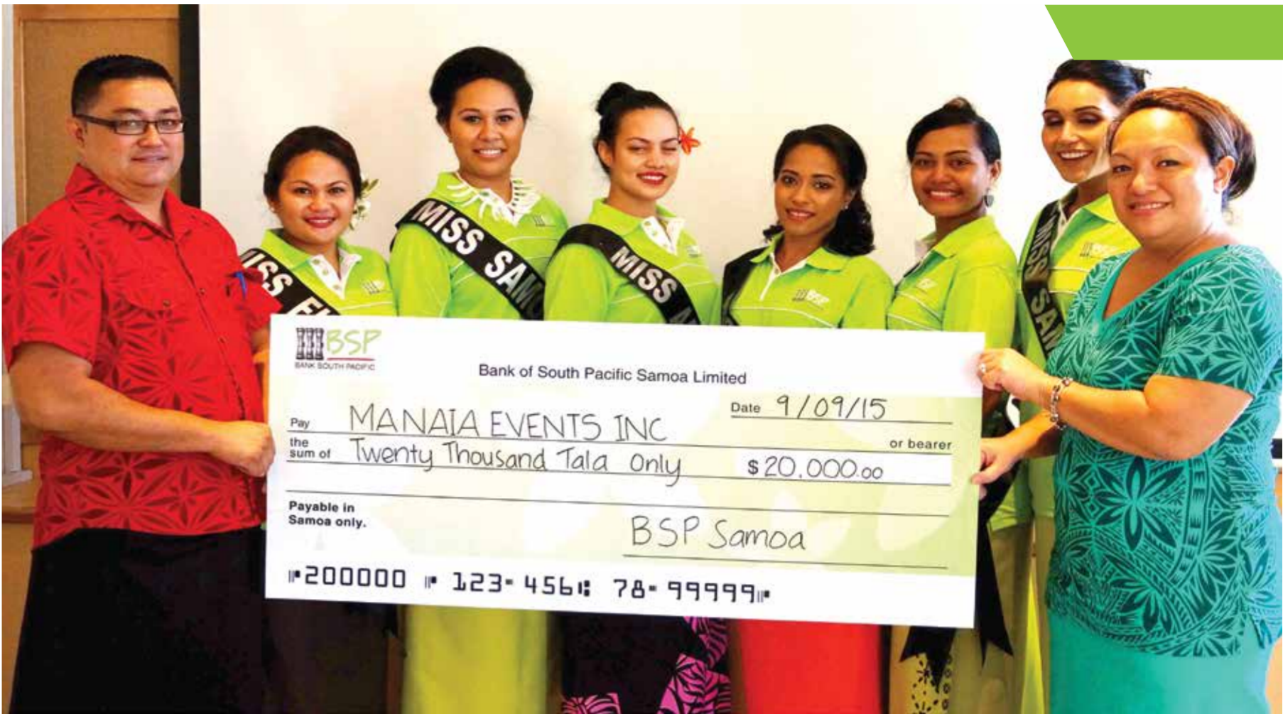
Miss Samoa Pageant.