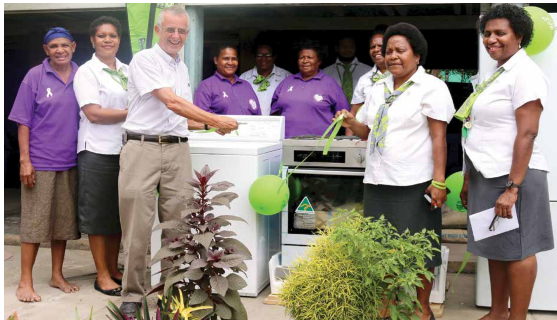
Helping shelter women in need. Our Boroko and Port Moresby Branches helped the City Mission.