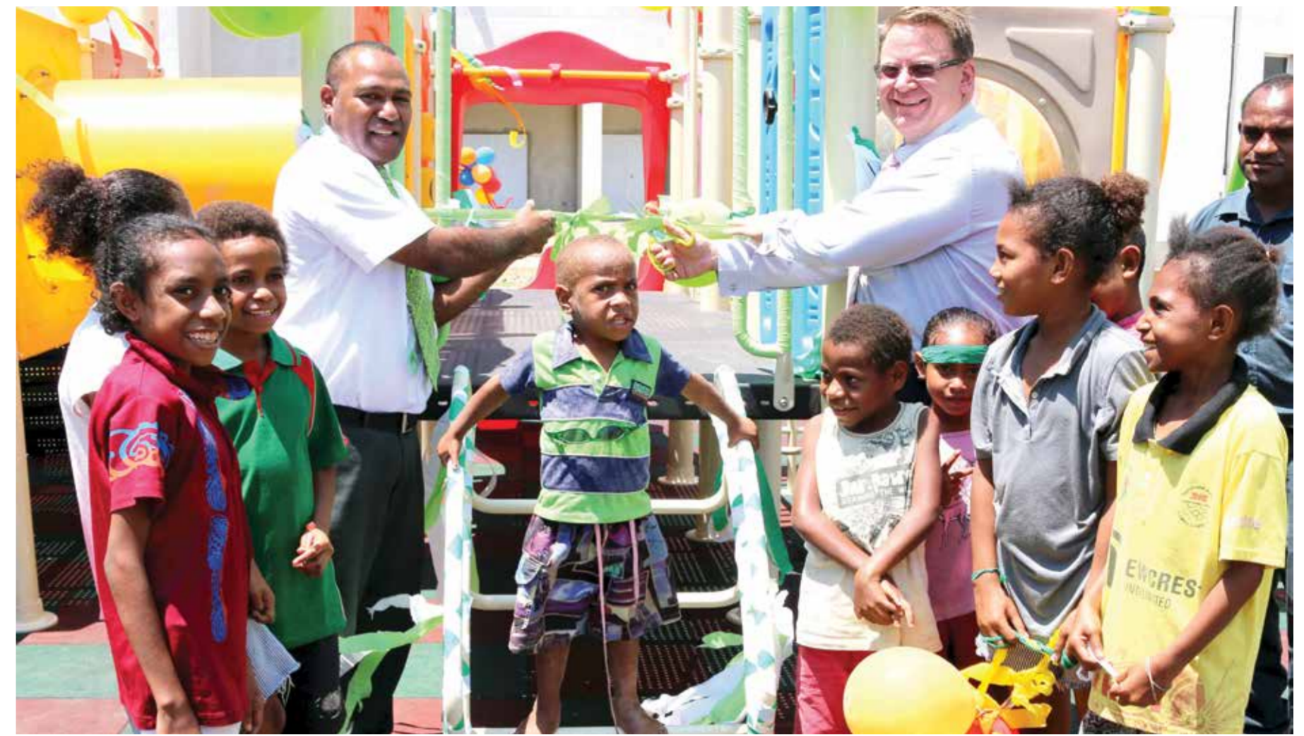
New playground at the Port Moresby General Hospital , built by our two Waigani Branches in Port Moresby. Playing and laughing is good therapy.

Each year we deliver many worthy projects that make a meaningful difference to recipient communities