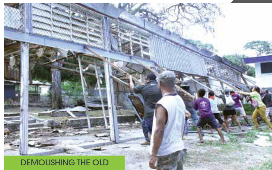
DEMOLISHING THE OLD