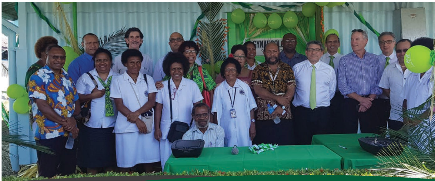
Madang Branch Renovation of the Gynaecology Ward at Modilon General Hospital, Madang Province