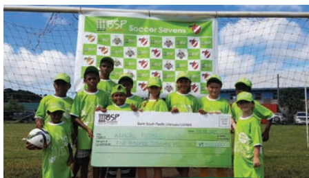
BSP Vanuatu Soccer Sevens

5 projects focused on Water and Sanitation