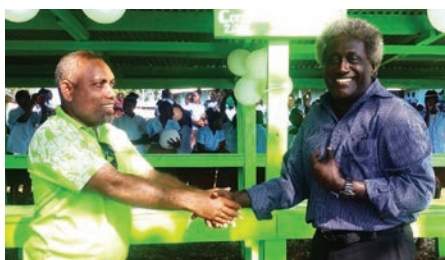
BSP Solomon Islands renovated a market shelter