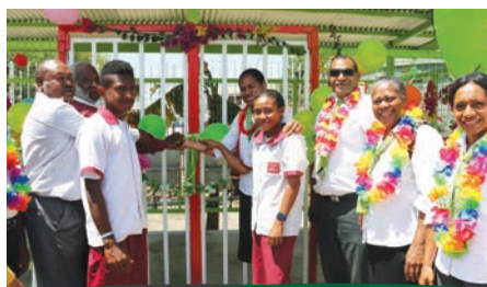
BSP Human Resource built a drinking shed for Hohola Demonstration School