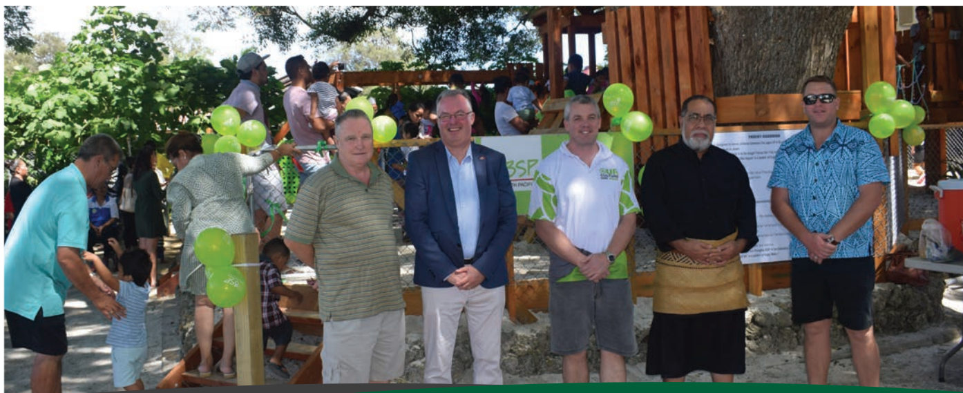
BSP Tonga built a playground at the carpark behind the Branch

We recognise that as a growing Bank in the Pacific, we have a special responsibility to our people, our customer and our community. BSP Community Projects are executed through all our Branches in PNG, Fiji, Solomon Islands, Cook Islands, Samoa, Tonga and Vanuatu. Our staff volunteer their time to assist in the completion of each project. Our Community Project are also undertaken by Strategic Business Units (SBUs).