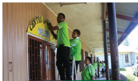
BSP Lae Market Branch cleaned up Family Support Centre