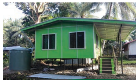
BSP Alotau renovated two Birth Houses and installed water tanks