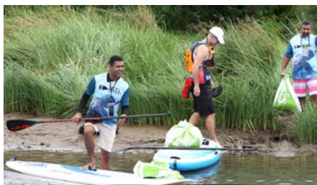
Paddling for Healthy Oceans Rubbish collection along Rewa & Navua Villages