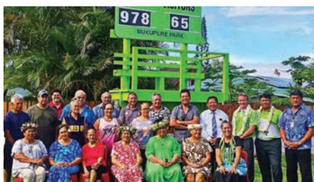
BSP Cook Islands built scoreboards