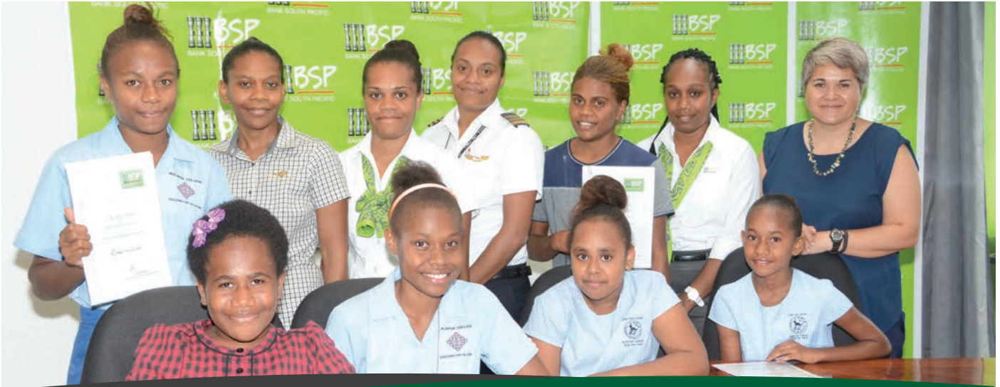
Vanuatu BSP Women's Grant Scholarship has assisted young women pursue and further their education.

Our teams in the Pacific Islands also delivered worthy projects in their communities.