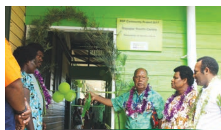
BSP Kokopo renovated the ablution block for Napapap Health Clinic