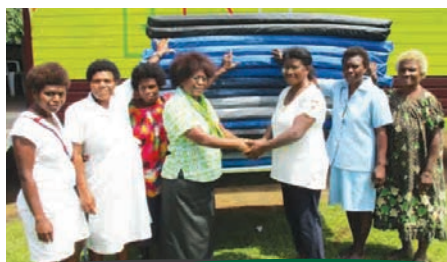
BSP Bialla donated mattresses for Bialla clinic