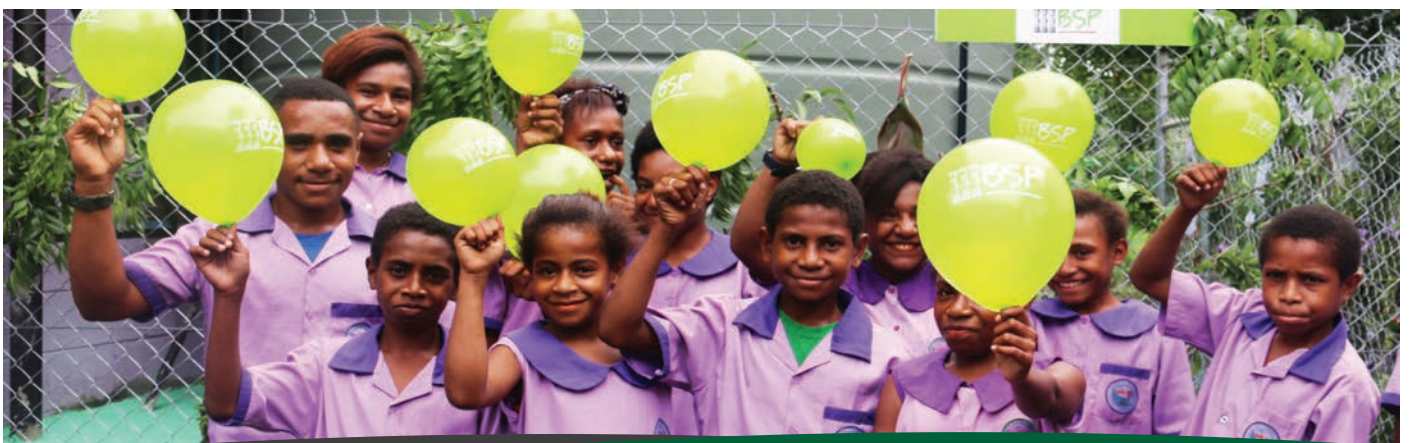
Boreboa school gets new water tank