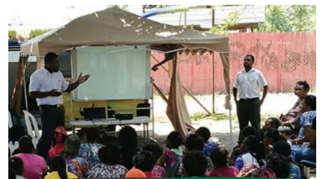
Banking Education Team conducting training