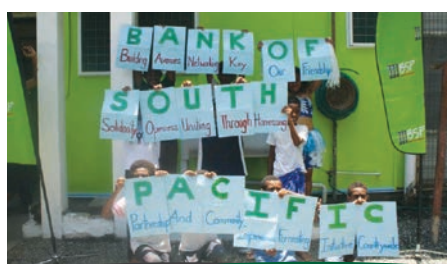
BSP Capital Ltd renovated a ablution block for Save our Children and Youth