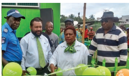
BSP Daru built a cop shop at the main market