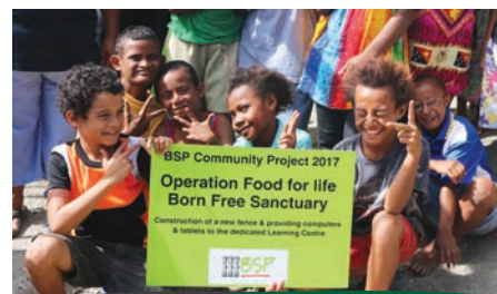
BSP Treasury built a new fence and donated computers to Operation Food for Life program