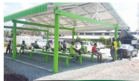
BSP Group Risk Management built a waiting area for patients at Gerehu Hospital