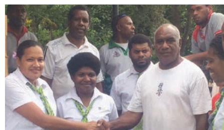
BSP Solomon Islands donate to Ambae Community