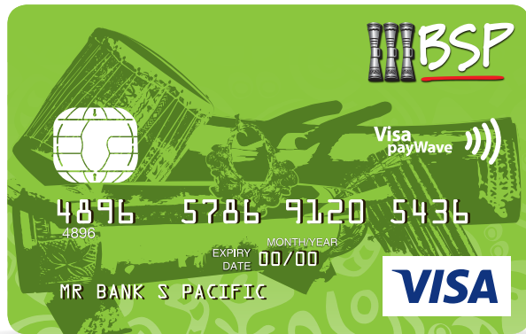
BSP CLASSIC VISA DEBIT CARD

Access your money in your BSP Kundu Account when shopping in stores or online, over the phone and wherever Visa is accepted, worldwide.