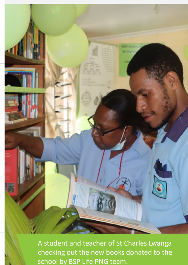
A student and teacher of St Charles Lwanga checking out the new books donated to the school by BSP Life PNG team.