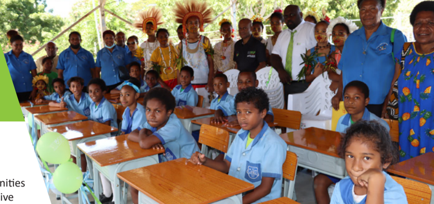
Port Moresby Branch team hand over their 2021 Community Project by presenting desks, teachers' chairs, book shelves and white boards to students and teachers of St Therese Primary School in Badili, NCD.