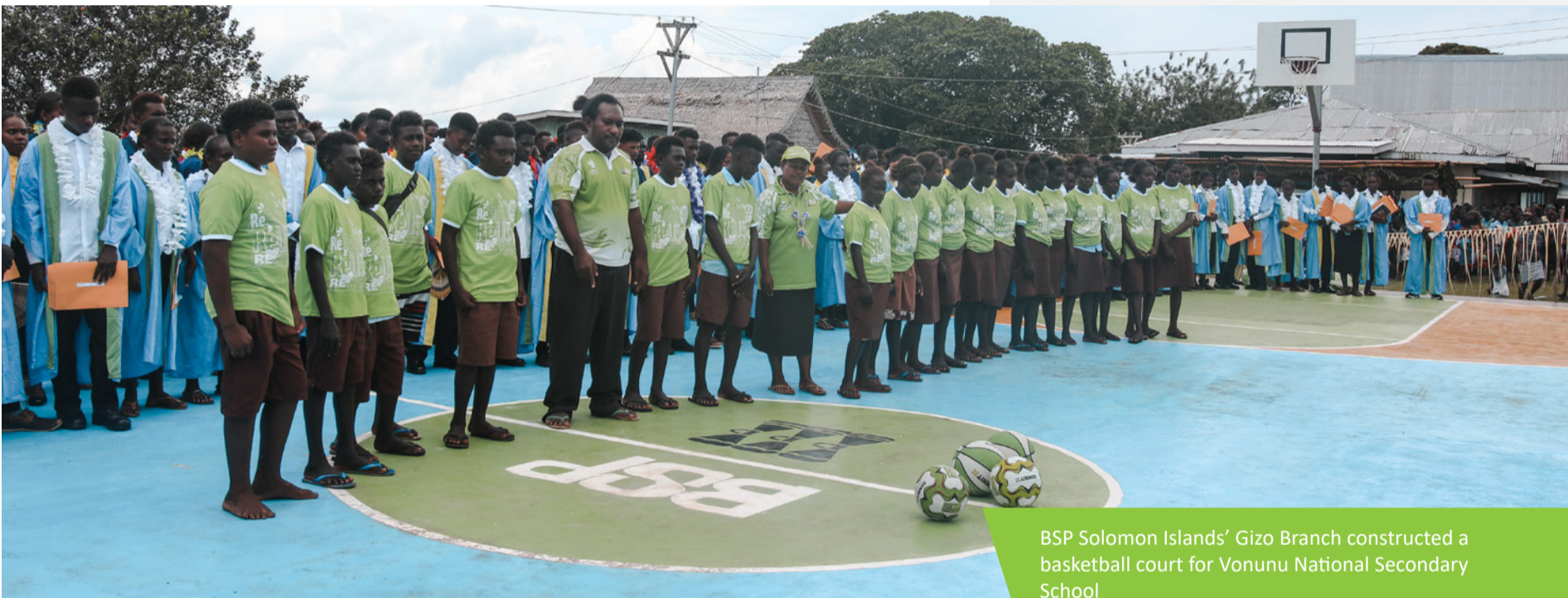
BSP Solomon Islands' Gizo Branch constructed a basketball court for Vonunu National Secondary School