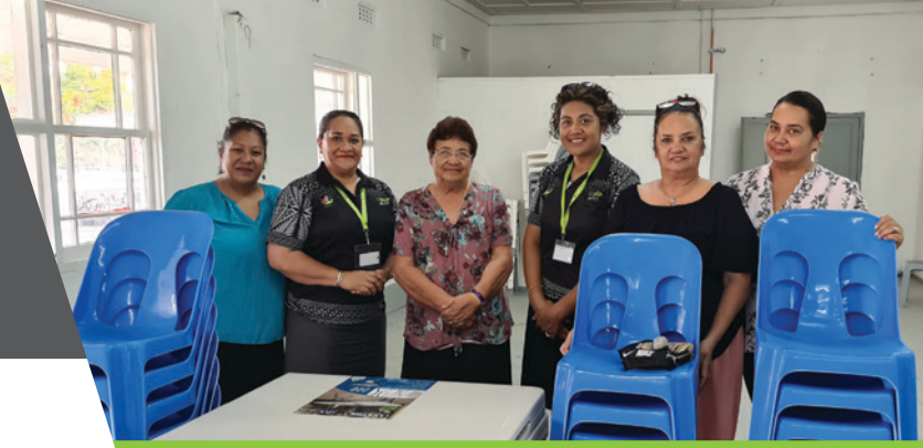
BSP Tonga refurbished and handover the St Paul's Hall which will be used as an SME Centre.